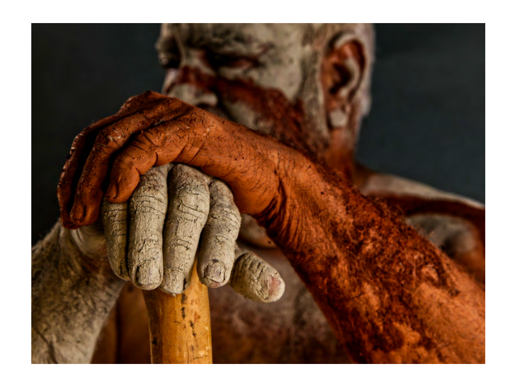
Ritual, Wagal (Vernamay) #1, 2021 Photograph on cotton rag

35.5 x 48 cm —$ 1,800 59 x 84 cm— $ 3,200