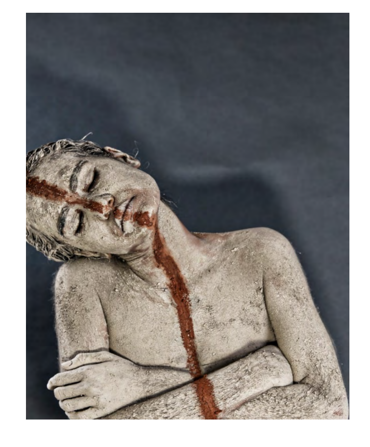
Ritual, Bawi (nan) #4, 2021 Photograph on cotton rag