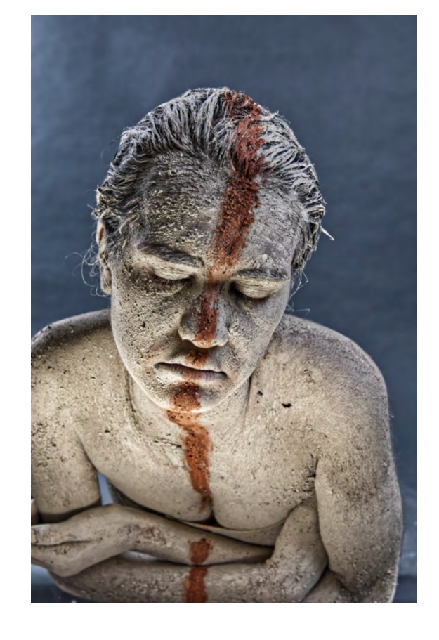
Ritual, Bawi (nan) #2, 2021 Photograph on cotton rag