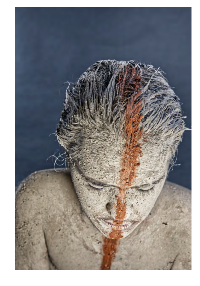
Ritual, Bawi (nan) #1, 2021 Photograph on cotton rag

48 x 35.5cm —$ 1,800 84 x 59cm— $ 3,200 Edition of 6 both sizes