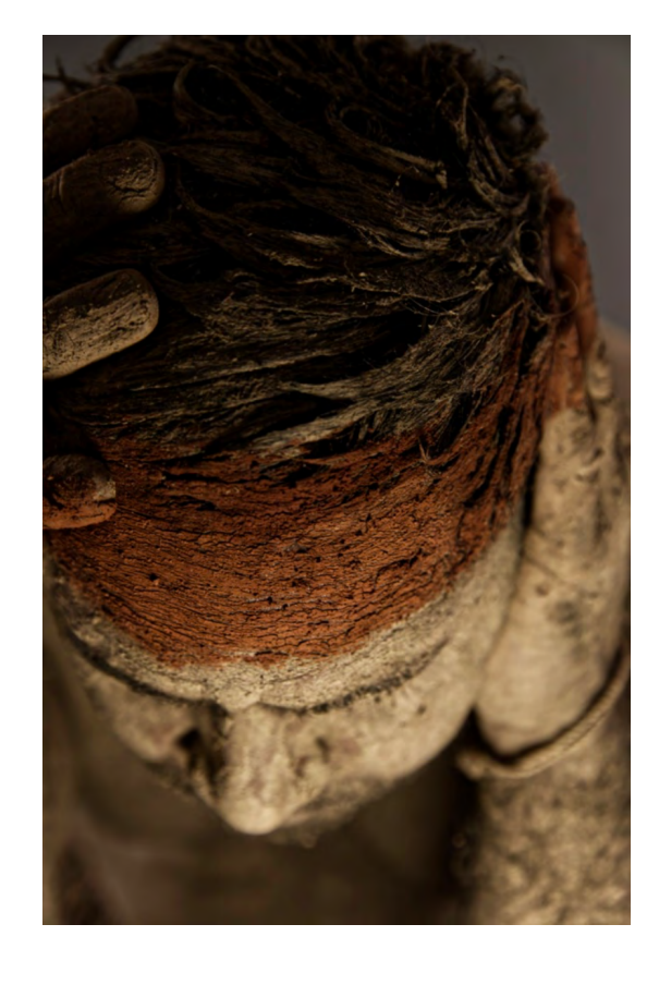
Ritual, Ngama (mum) #3, 2021 Photograph on cotton rag