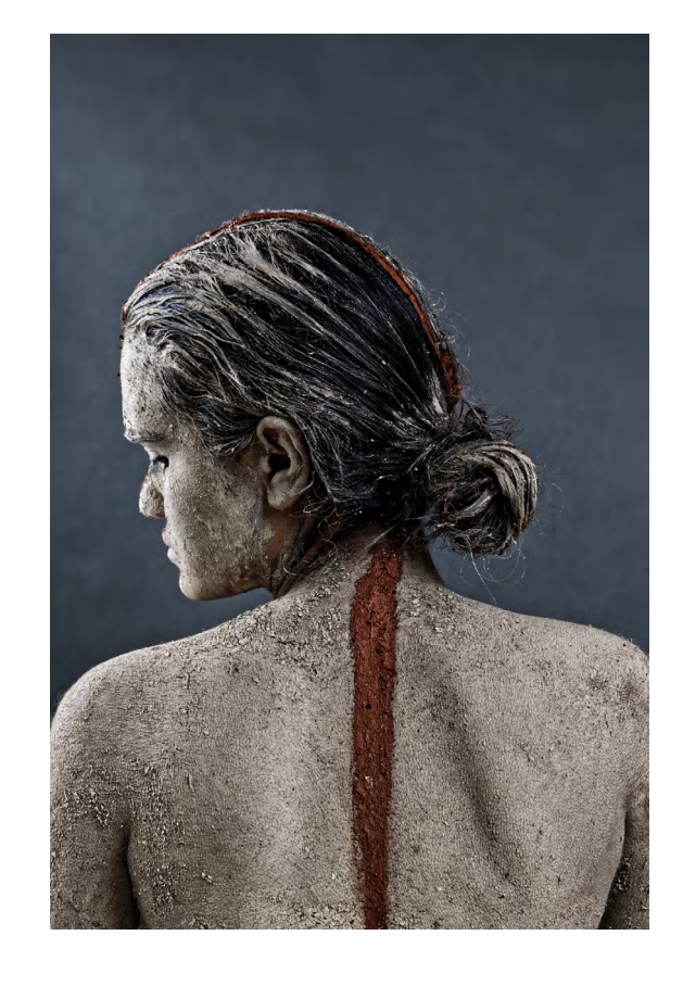
Ritual, Bawi (nan) #5, 2021 Photograph on cotton rag