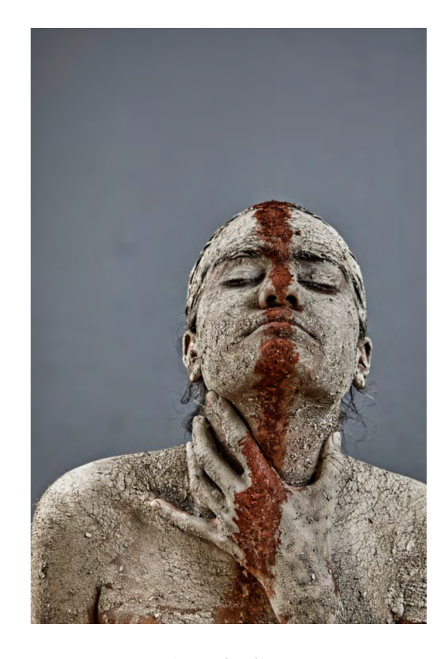
Ritual, Bawi (nan) #3, 2021 Photograph on cotton rag