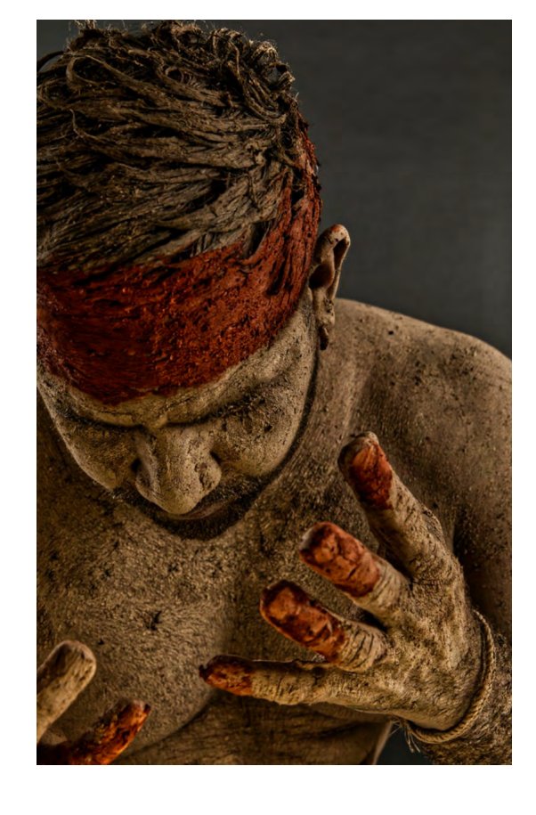
Ritual, Ngama (mum) #6, 2021 Photograph on cotton rag

48 x 35.5cm —$ 1,800 84 x 59cm— $ 3,200 Edition of 6 both sizes