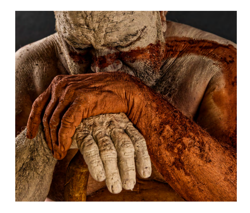
Ritual, Wagal (Vernamay) #3, 2021 Photograph on cotton rag

35.5 x 48 cm —$ 1,800 59 x 84 cm— $ 3,200