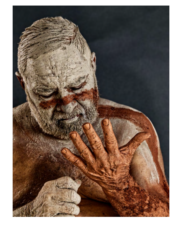
Ritual, Wagal (Vernamay) #4, 2021 Photograph on cotton rag