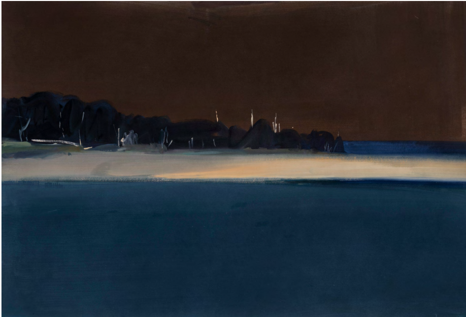
Burnt Sky , 2022 Gouache on paper 112 x 163cm