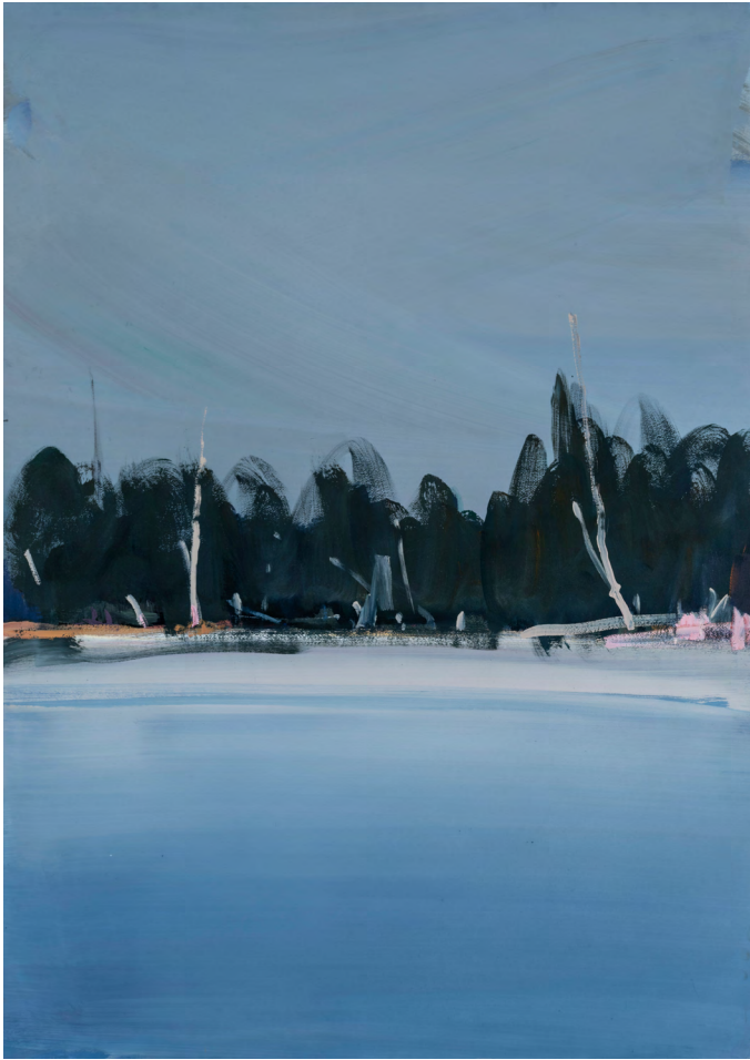
Life Ashore, 2022 Gouache on paper 112 x 81cm