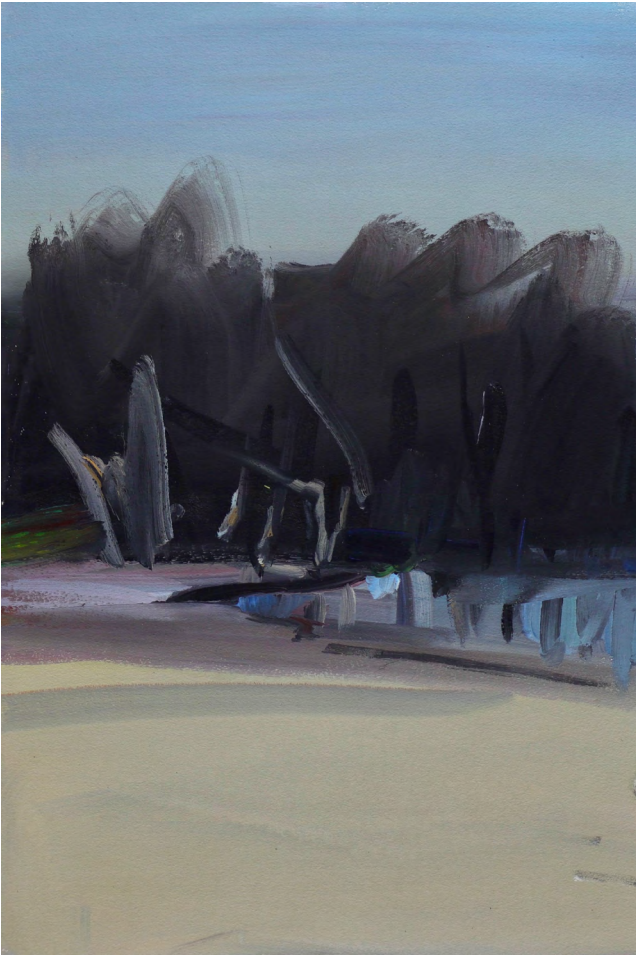
Ebb and Flow , 2022 Gouache on paper 55 x 37cm