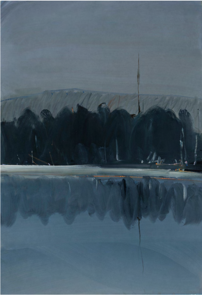
Growth Spurt , 2022 Gouache on paper 112 x 74cm