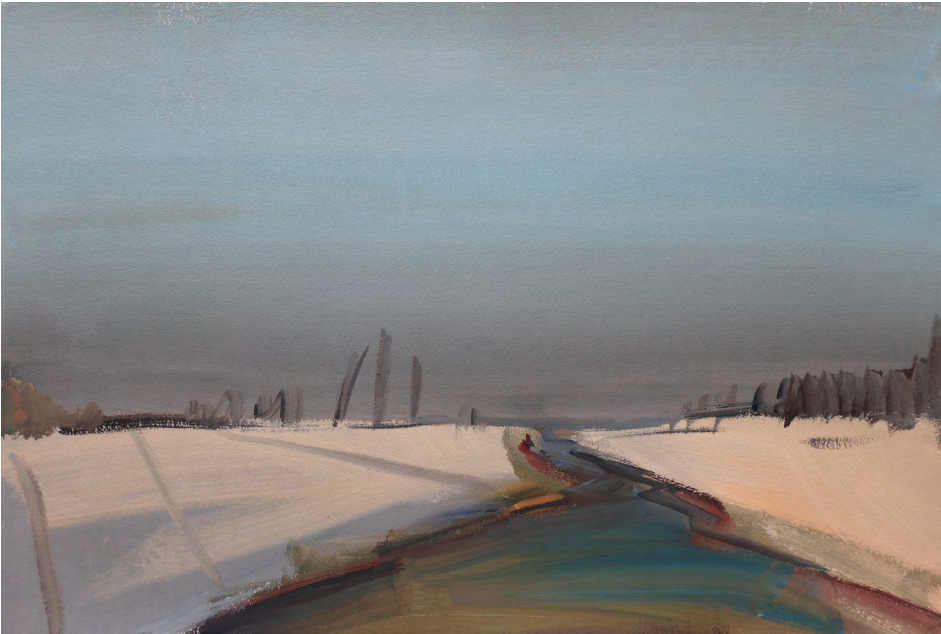
Where All Paths Lead, 2022 Gouache on paper 37 x 55cm