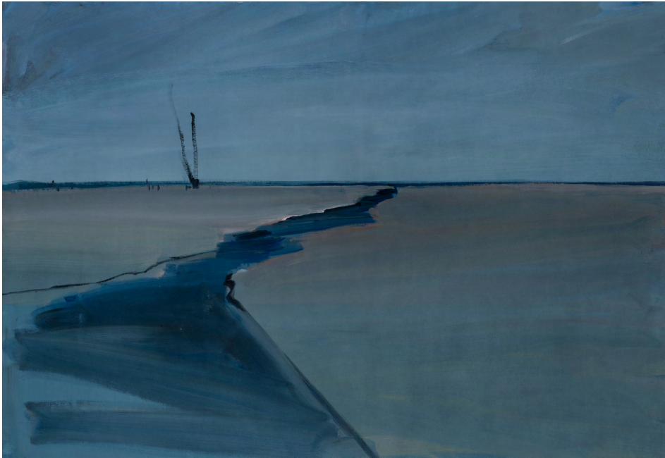
Water Always Finds A Way , 2022 Gouache on paper 74 x 122cm