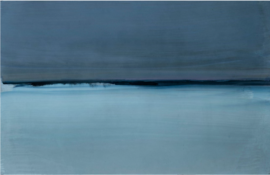
Late Night Dip , 2022 Gouache on paper 74 x 122cm