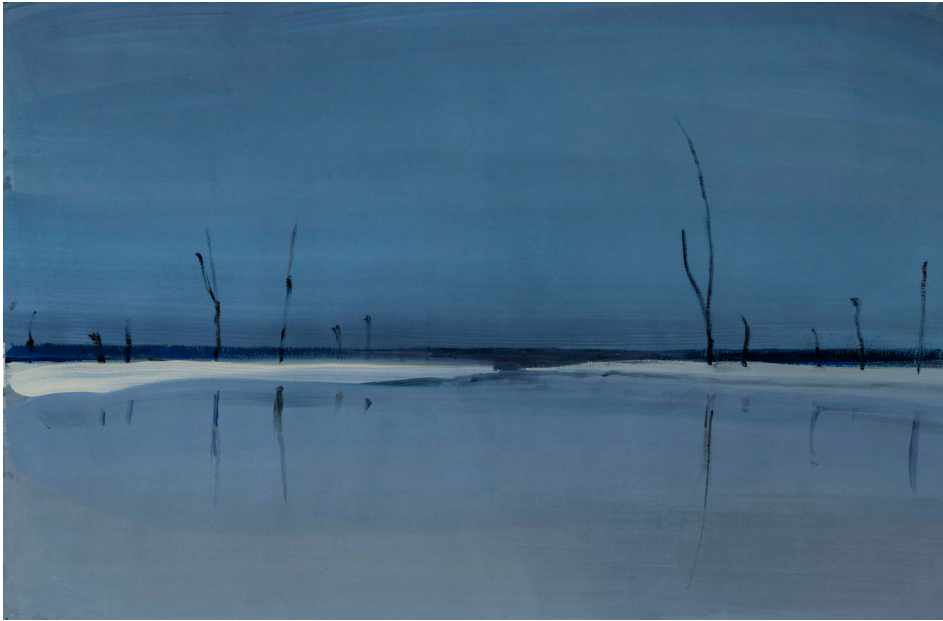
Sticking Out , 2022 Gouache on paper 74 x 112cm