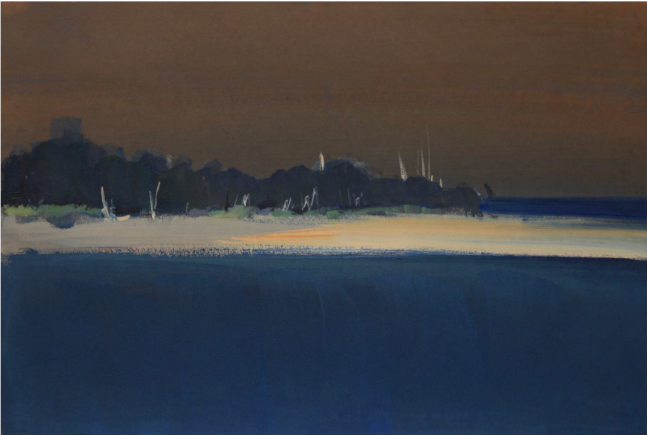
End of The Line , 2022 Gouache on paper 37 x 55cm