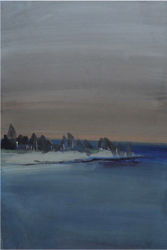
Taken By The Tide, 2022 Gouache on paper 55 x 37cm