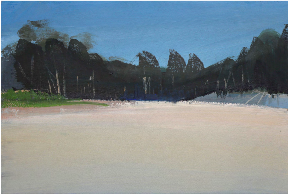
There Is Strength In Numbers, 2022 Gouache on paper 37 x 55cm