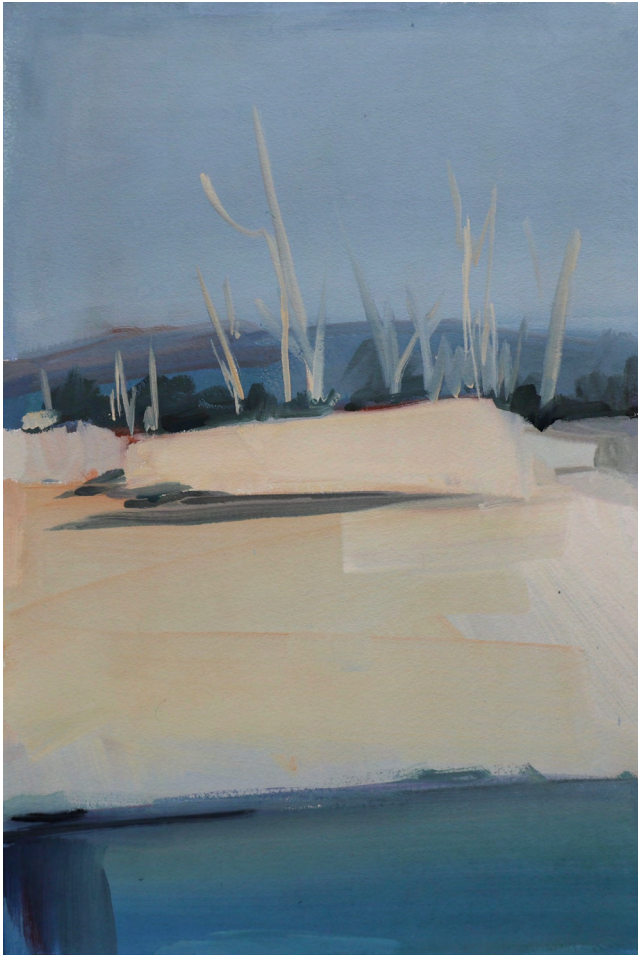
I Only Make Friends With Tall People , 2022 Gouache on paper 55 x 37cm