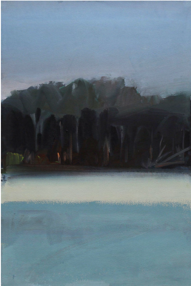
We Come By Boat, 2022 Gouache on paper 55 x 37cm