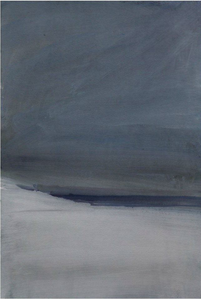
Shifting Sands , 2022 Gouache on paper 55 x 37cm