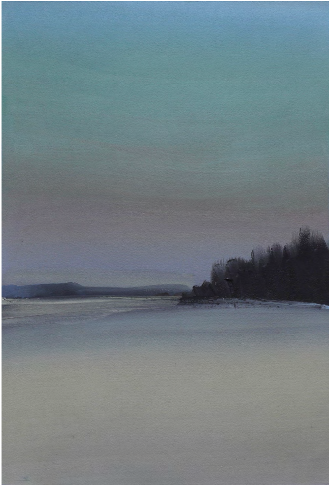
I'm Sure You've Heard It All Before, 2022 Gouache on paper 55 x 37cm