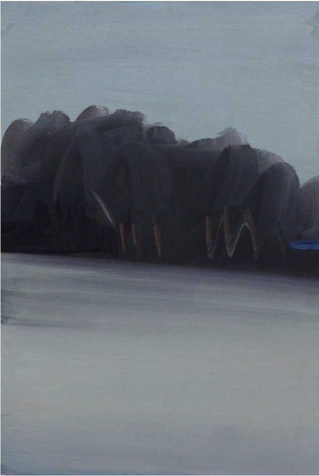
The Monsters Come Out At Night, 2022 Gouache on paper 55 x 37cm