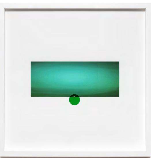
Nature Green, 2023 Digital print on cotton rag, colour filter, T pin. Unique print. Diptych (two framed panels, 84.5 x 84.5 cm each)