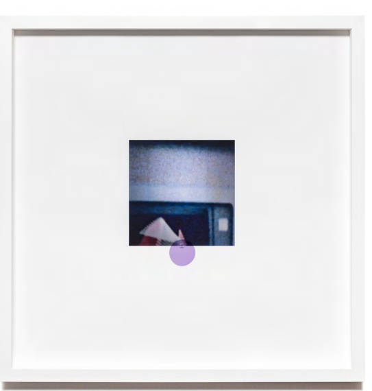
Introverted Purple, 2023 Digital print on cotton rag, colour filter, T pin. Unique print. Diptych (two framed panels, 84.5 x 84.5 cm each)