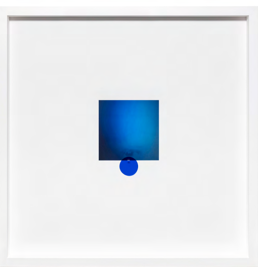
Loyal Blue, 2023 Digital print on cotton rag, colour filter, T pin. Unique print. Diptych (two framed panels, 84.5 x 84.5 cm each)