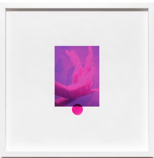
Impulsive Magenta, 2023 Digital print on cotton rag, colour filter, T pin. Unique print. Diptych (two framed panels, 84.5 x 84.5 cm each)