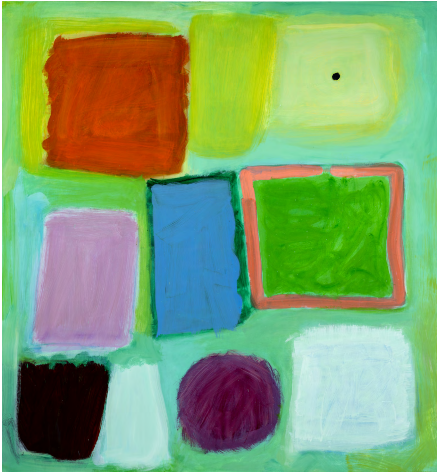
Black hole and colours from the art shop (2), 2023 Oil on linen 149 x 136.5cm