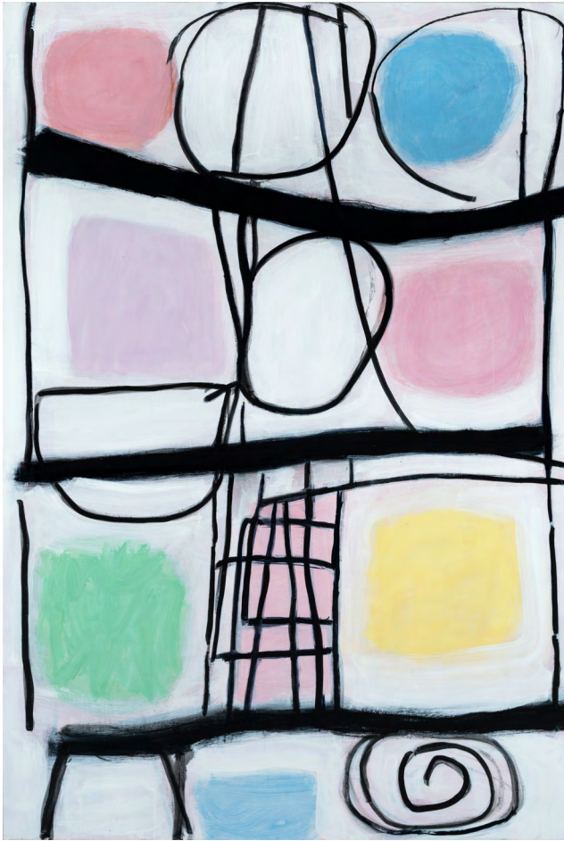
Sometimes and Always, 2023 Oil on linen 188.5 x 126cm