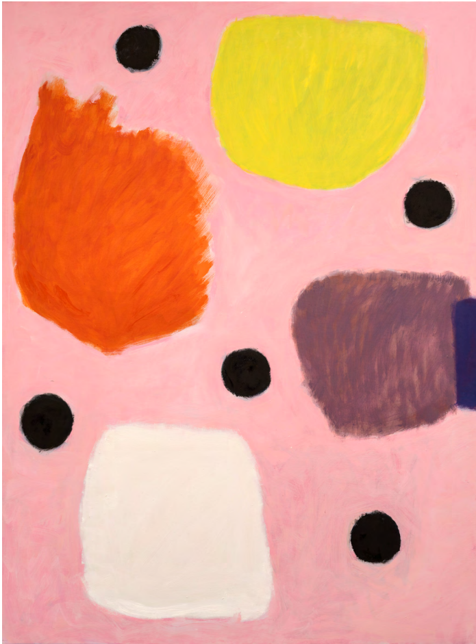
Sets of sets (one) , 2023 Oil on linen 183 x 137.5cm