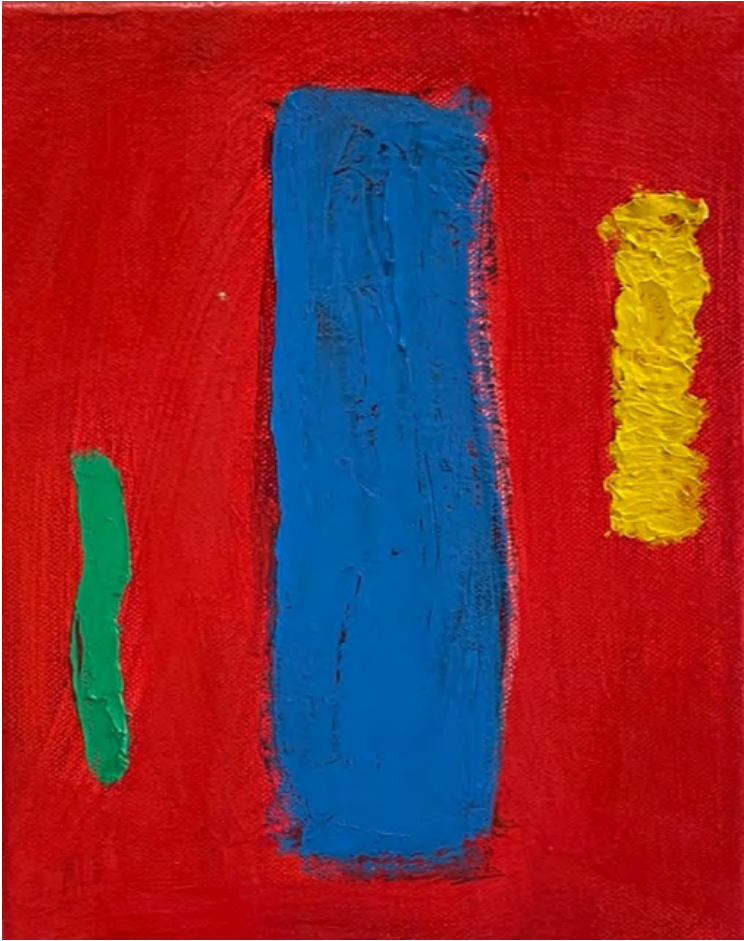
Obsession (1) , 2023 Oil on linen 25.5 x 20.5cm