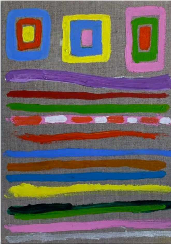
Big hippy , 2023 Oil on linen 35.5 x 25.5cm