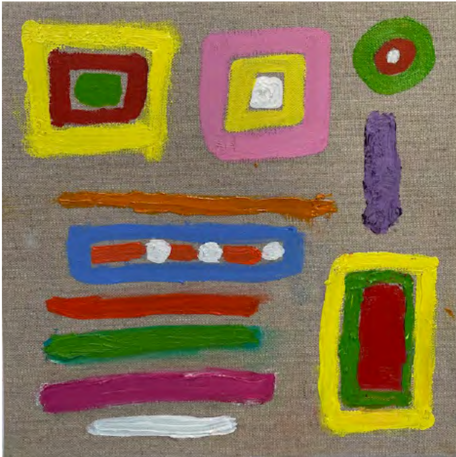
Little Hippy , 2023 Oil on linen 25 x 25cm