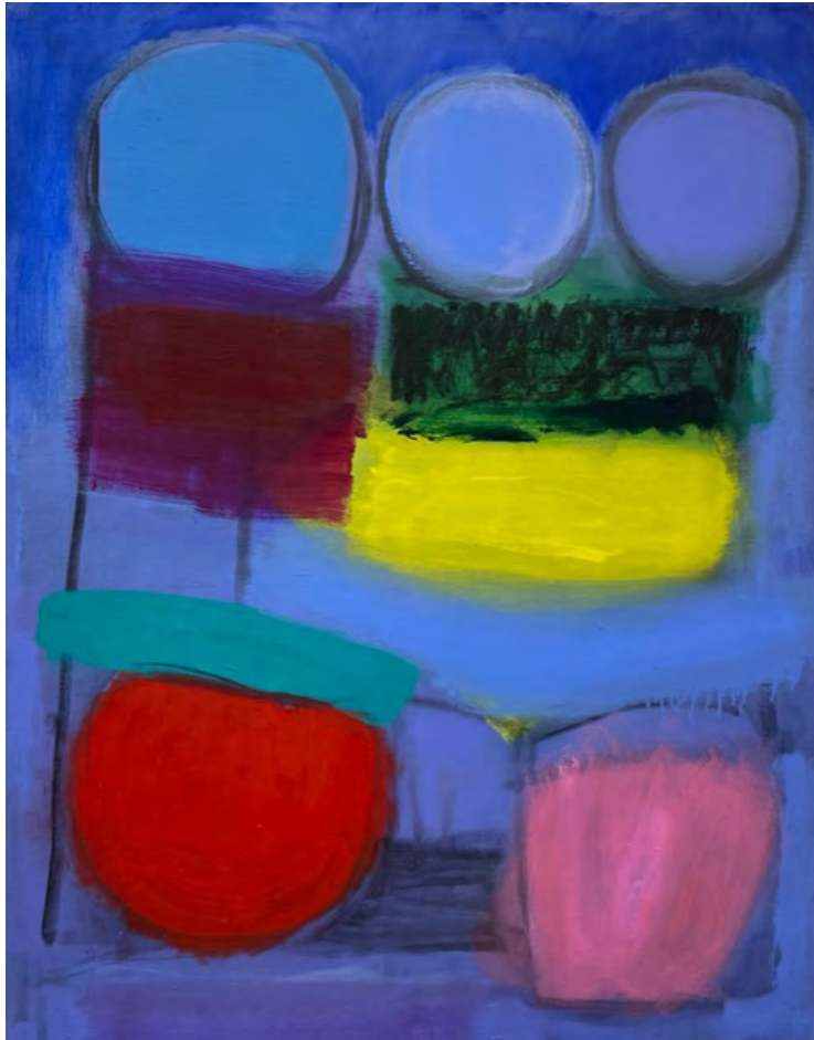
That, too, 2023 Oil on linen 90.5 x 70.5cm