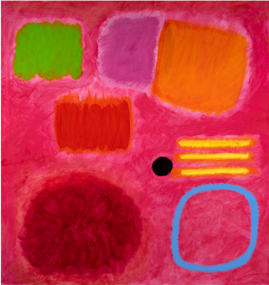
Reasons and Passions , 2023 Oil on linen 180.5 x 170.5cm