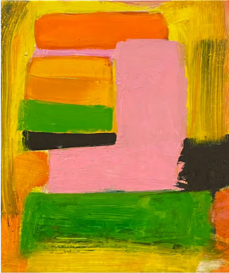
One morning, 2023 Oil on linen 60.5 x 50.5cm