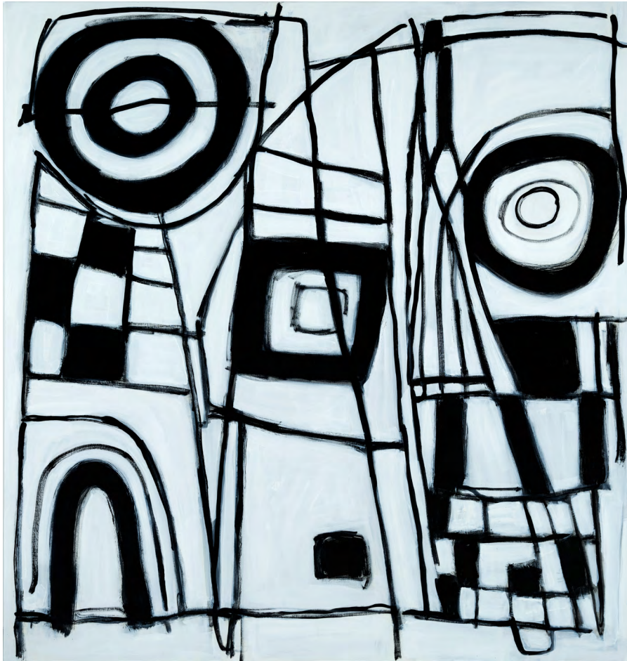
Up, Down, Strange, Charm, 2023 Oil on linen 148.5 x 136.5cm