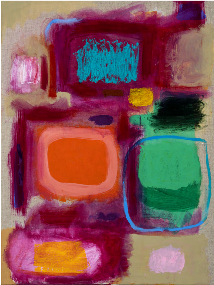
Visiting you again, 2023 Oil on linen 110.5 x 76.5cm