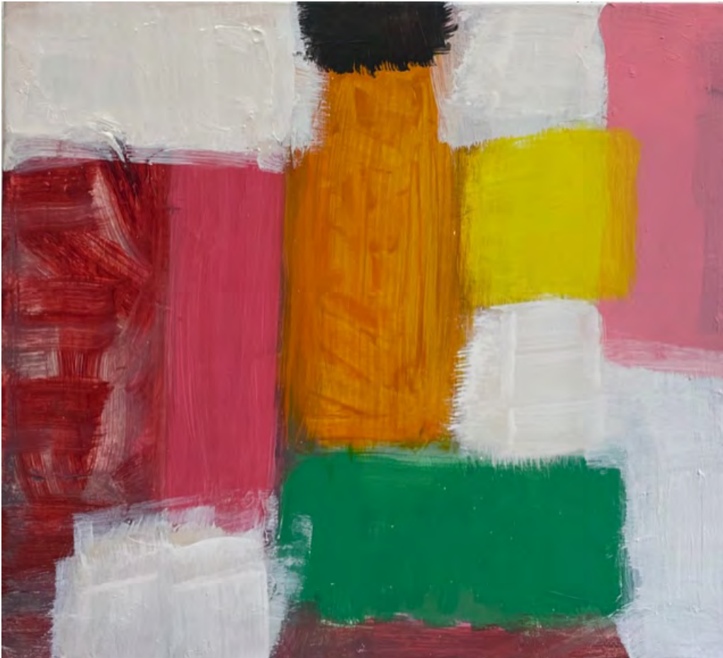
Wait there yellow square, 2023 Oil on linen 50.5 x 60.5cm