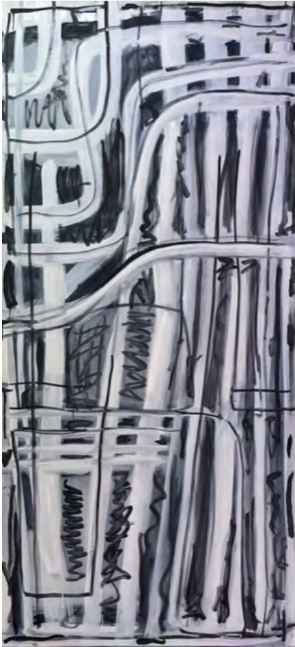
Always and Sometimes, 2023 Oil on linen 198 x 91.5cm