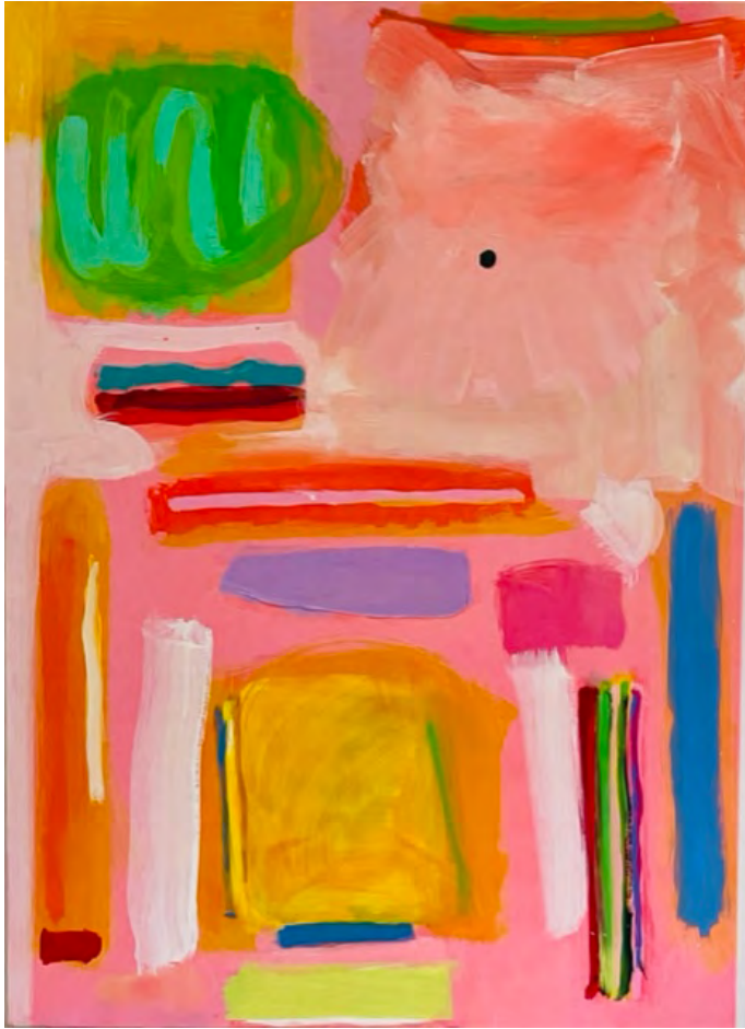
Black hole and colours from the art shop (1), 2023 Oil on linen 105.5 x 75.5cm