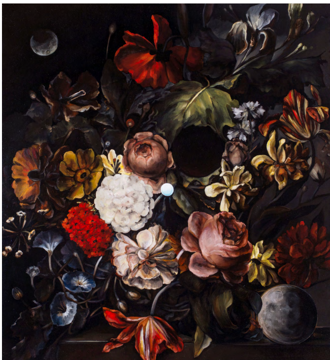
Deep Space, Small Death 2017 Oil on canvas, 89.7 x 80.1 cm