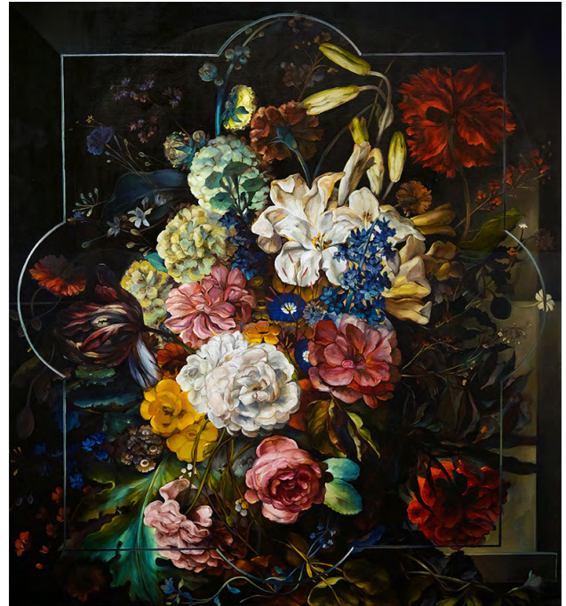
Gold Standard 2016 Oil on canvas, 145 x 135 cm