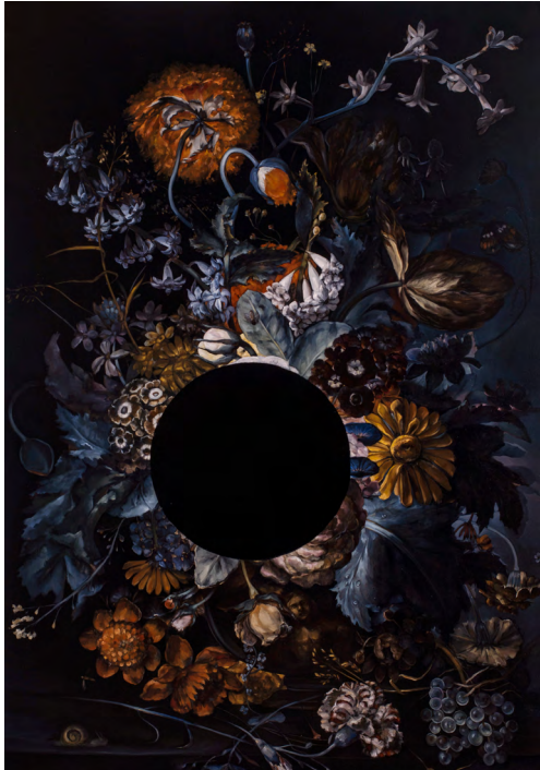
The Sense of an Ending 2017 Oil and enamel on canvas, 160 x 110 cm