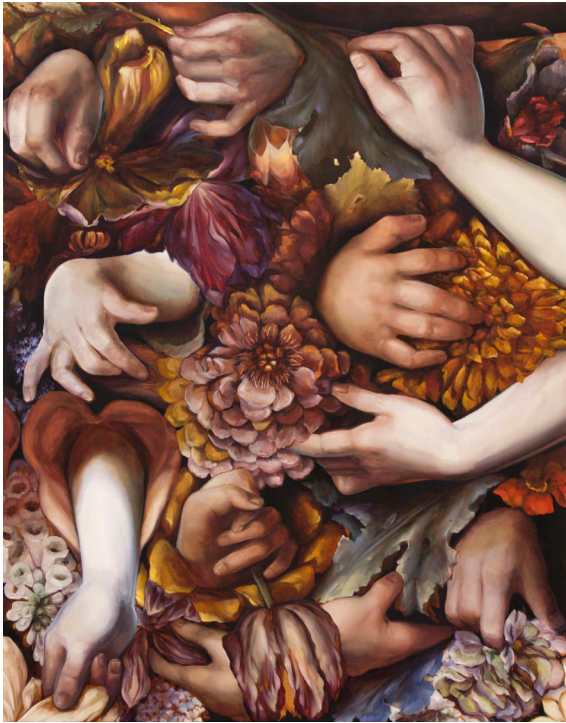
Moral Panic 2018 Oil on linen, 130 x 100 cm