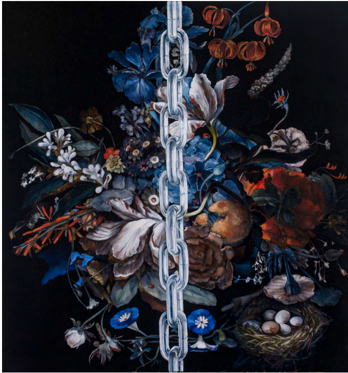
Tension Meter 2016 Oil on canvas, 70.2 x 65.1 cm