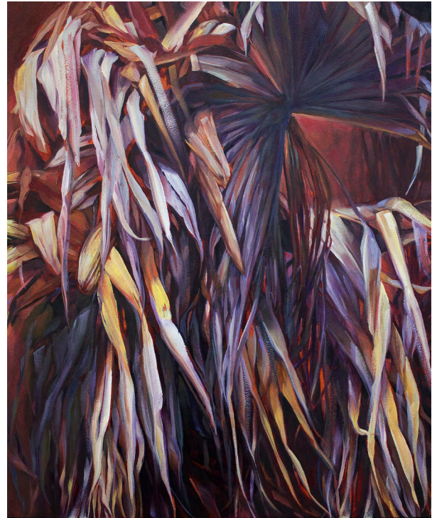
System Maintenance 2020 Oil on board, 50 x 40 cm