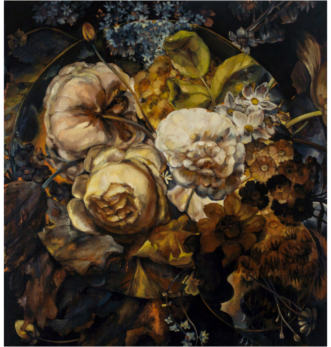
Soft Moon 2017 Oil on canvas, 70 x 65 cm