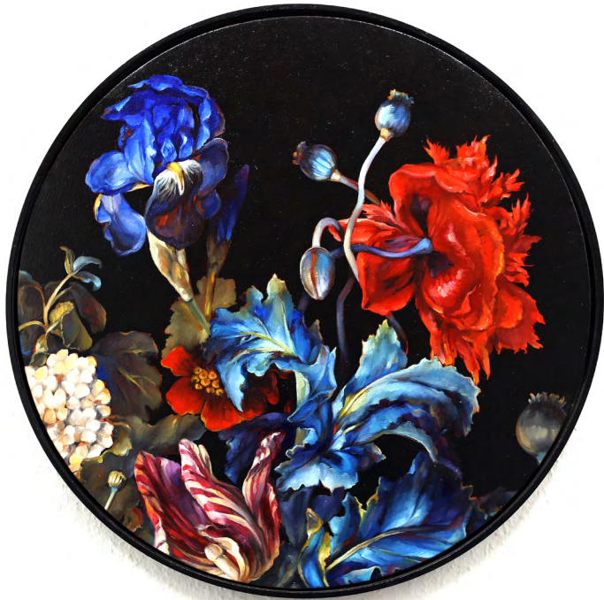
Left and Right 2017 Oil on canvas, 55 cm diameter