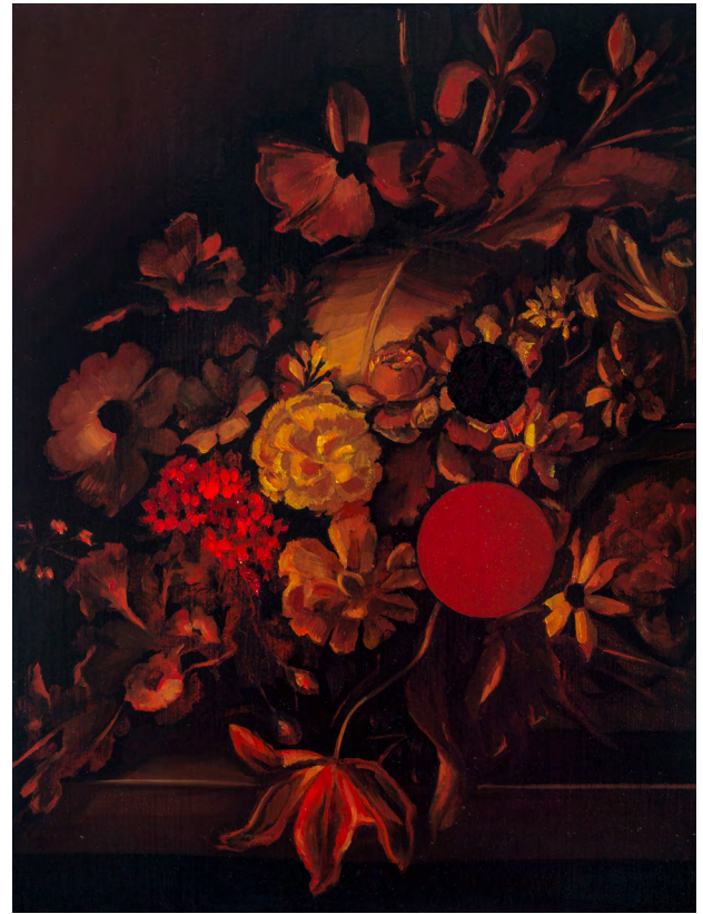
Lunar Still Life 2017 24.1 x 18.1 cm, oil and enamel on board