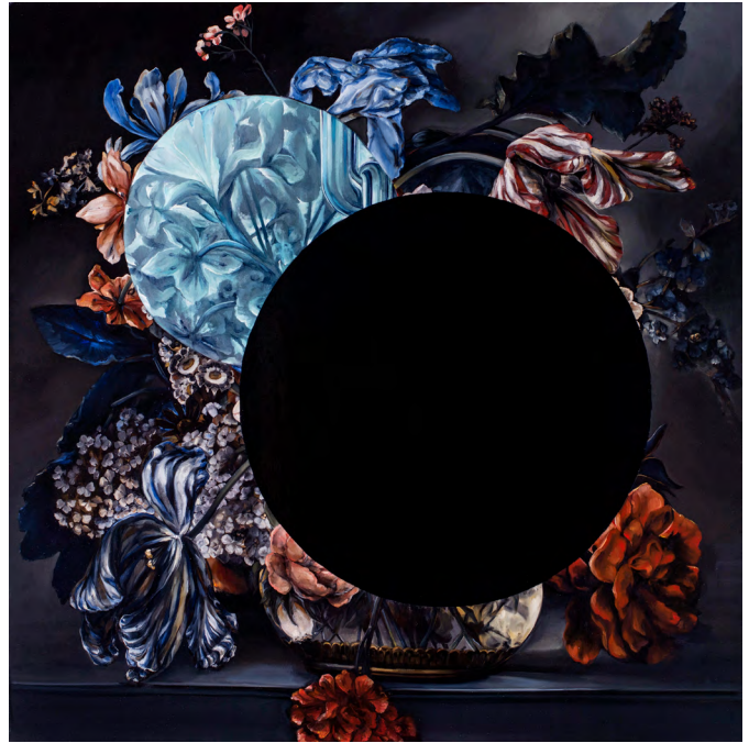
Eclipse 2017 Oil and enamel on canvas, 110.5 x 110 cm