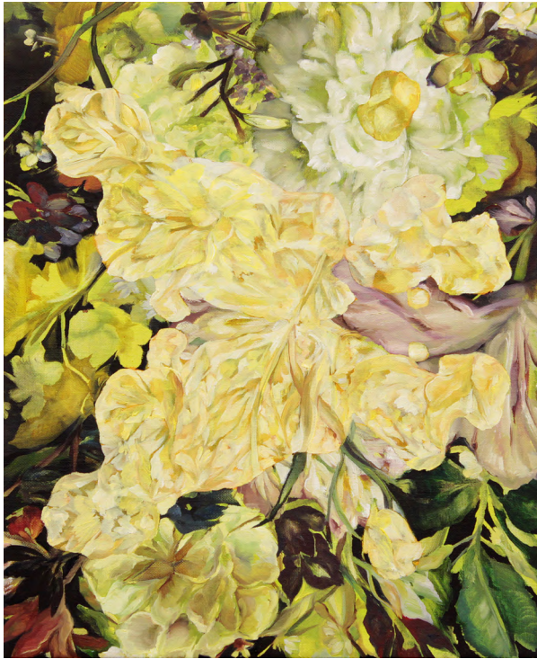
Rorshach collage 2018 Oil on linen, 50 x 40 cm