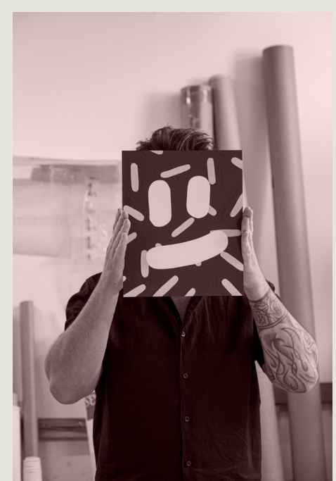
Studio images by Charlie Hillhouse.