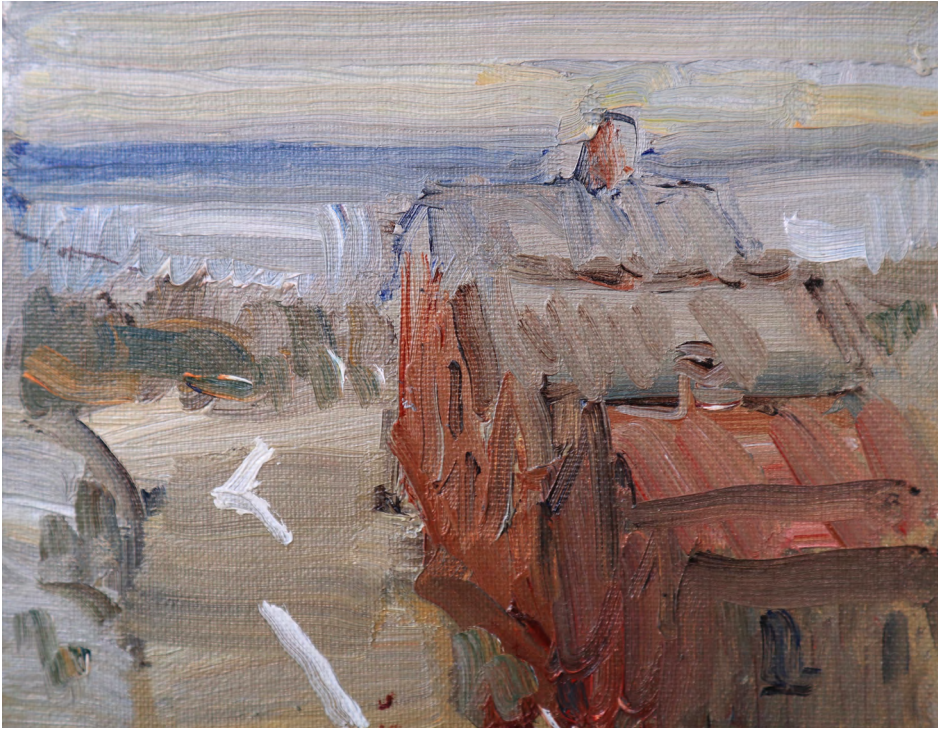
The Coastal Route, 2023 Oil on canvas, framed in Tasmanian oak 15 x 19 cm