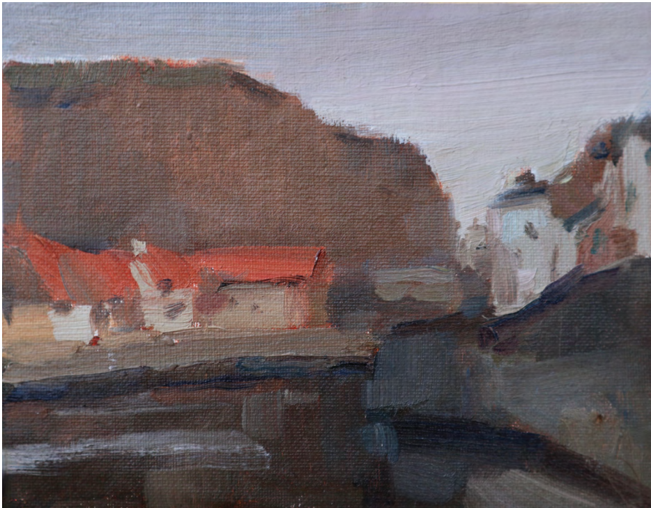
If Only We Had More Time Together, 2023 Oil on canvas, framed in Tasmanian oak 15 x 19 cm