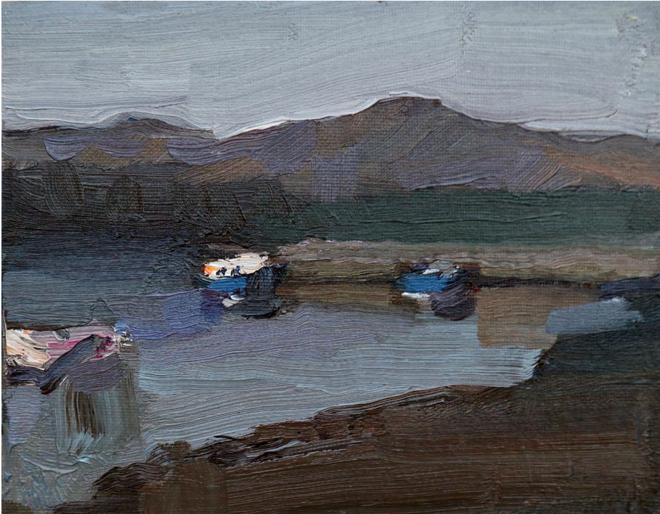
No Fixed Address, 2023 Oil on canvas, framed in Tasmanian oak 15 x 19 cm