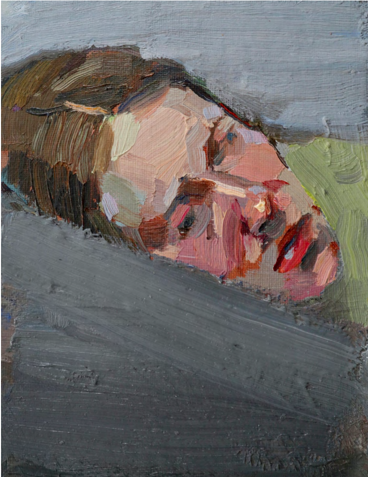
My Muse, 2023 Oil on canvas, framed in Tasmanian oak 19 x 15 cm