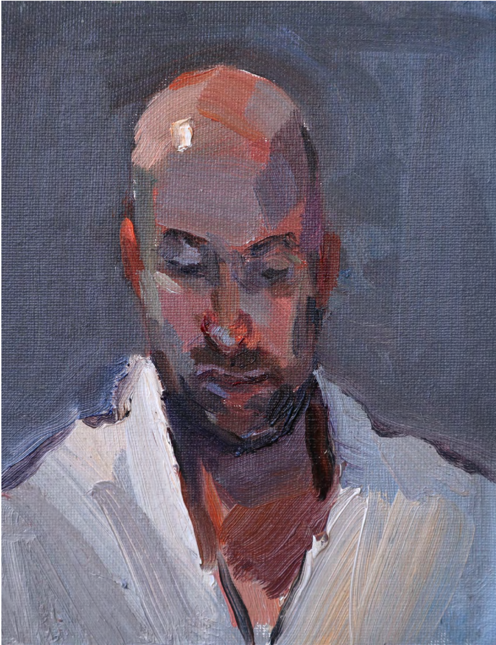
Long Lost Brother, 2023 Oil on canvas, framed in Tasmanian oak 19 x 15 cm