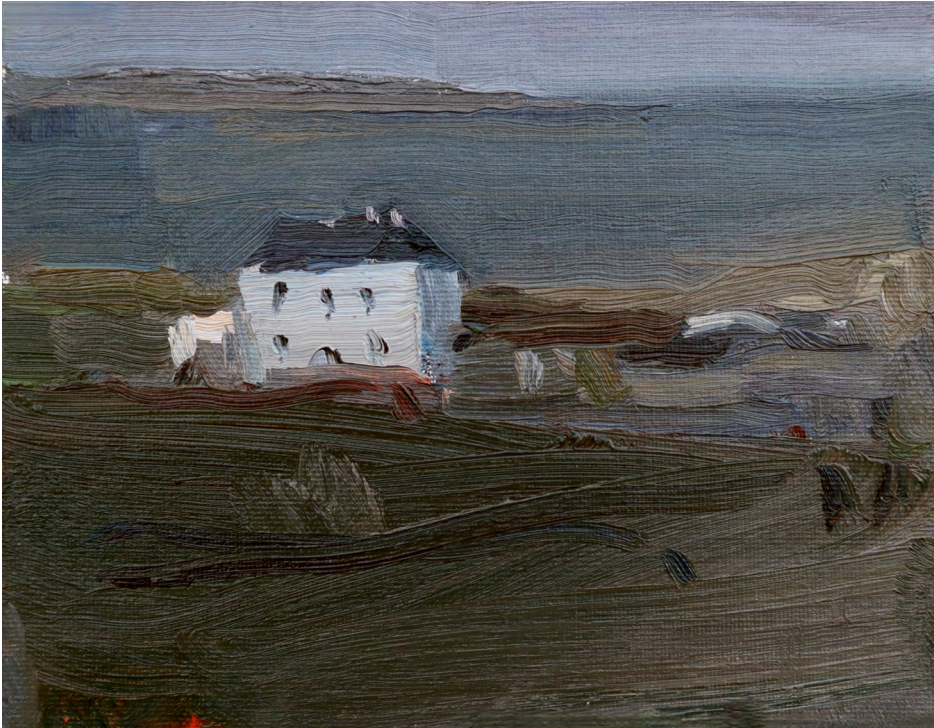
Exposed To The Elements, 2023 Oil on canvas, framed in Tasmanian oak 15 x 19 cm