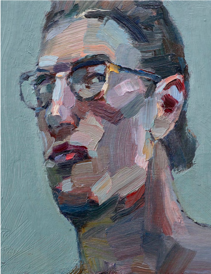
Four Eyes, 2023 Oil on canvas, framed in Tasmanian oak 19 x 15 cm