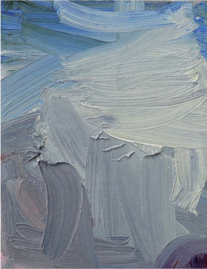
There's An Energy To This Place, 2023 Oil on canvas, framed in Tasmanian oak 19 x 15 cm