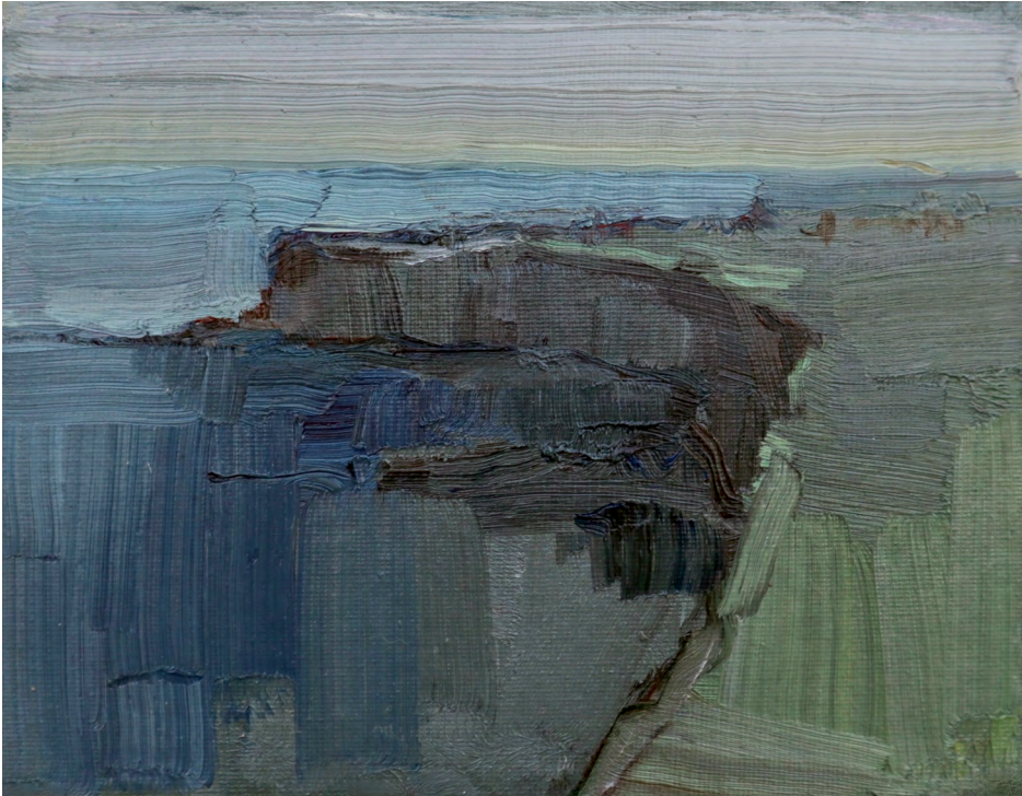
It's A Long Way Down, 2023 Oil on canvas, framed in Tasmanian oak 15 x 19 cm