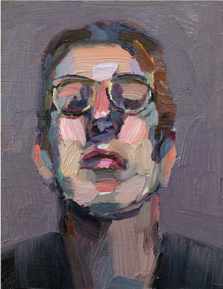
Jetlagged , 2023 Oil on canvas, framed in Tasmanian oak 19 x 15 cm