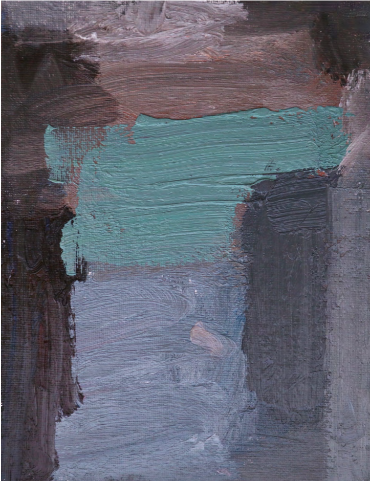
The Secret Waterfall, 2023 Oil on canvas, framed in Tasmanian oak 19 x 15 cm