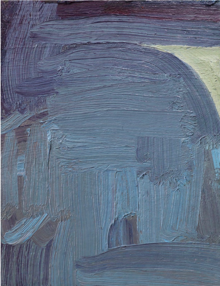
View From Above, 2023 Oil on canvas, framed in Tasmanian oak 19 x 15 cm