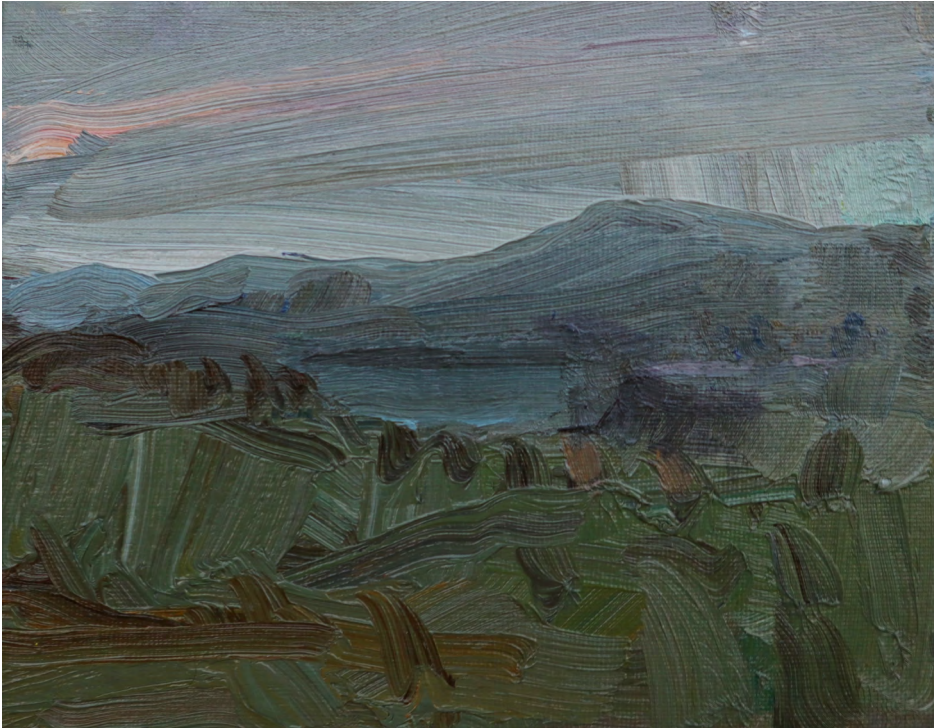
The Passage Through, 2023 Oil on canvas, framed in Tasmanian oak 15 x 19 cm