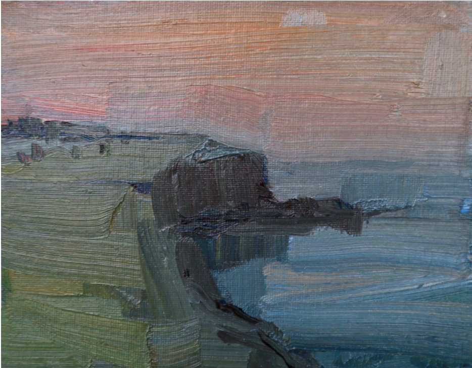
This Is What I Remember, 2023 Oil on canvas, framed in Tasmanian oak 15 x 19 cm