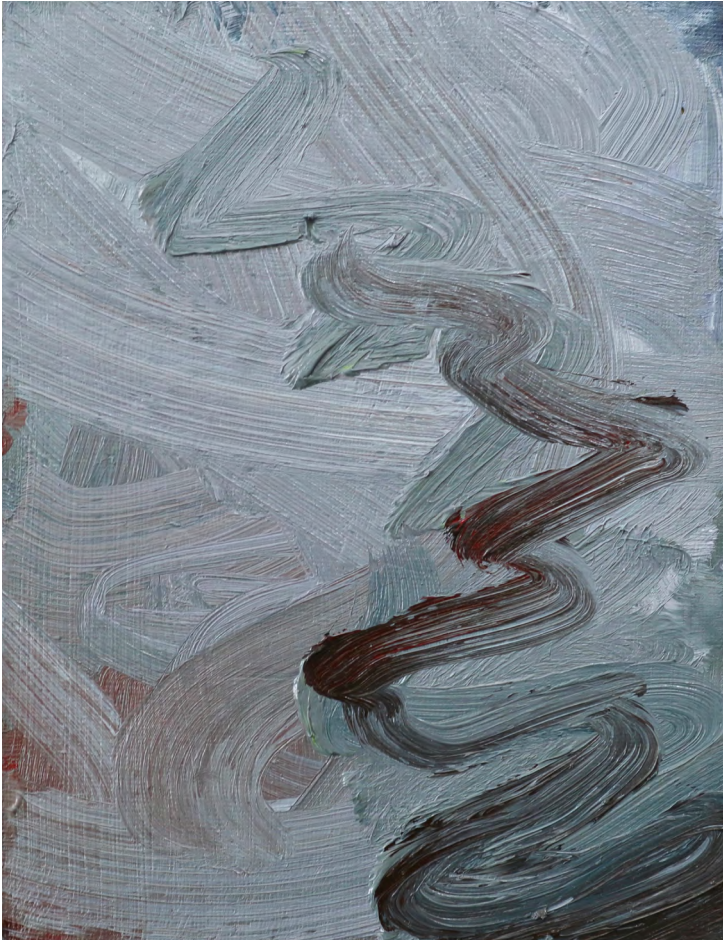
Eye Of The Storm, 2023 Oil on canvas, framed in Tasmanian oak 19 x 15 cm