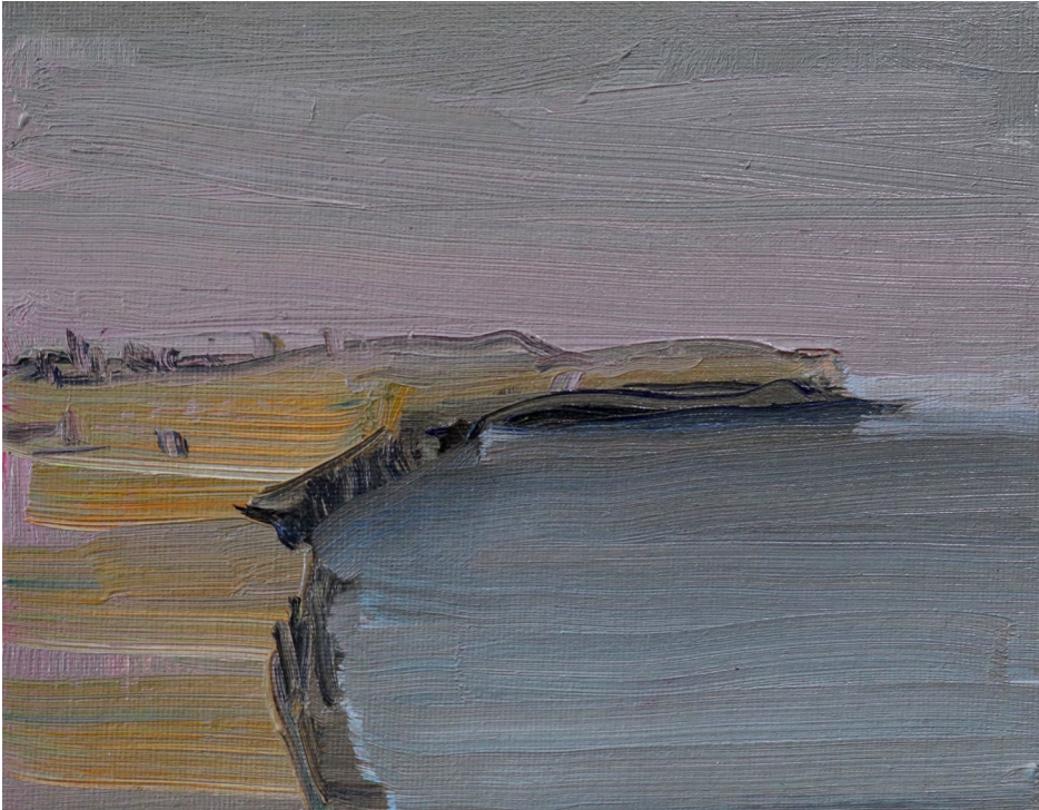
Lingering Light , 2023 Oil on canvas, framed in Tasmanian oak 15 x 19 cm