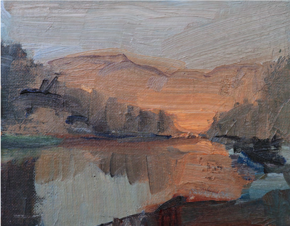
That Warm Inner Glow, 2023 Oil on canvas, framed in Tasmanian oak 15 x 19 cm