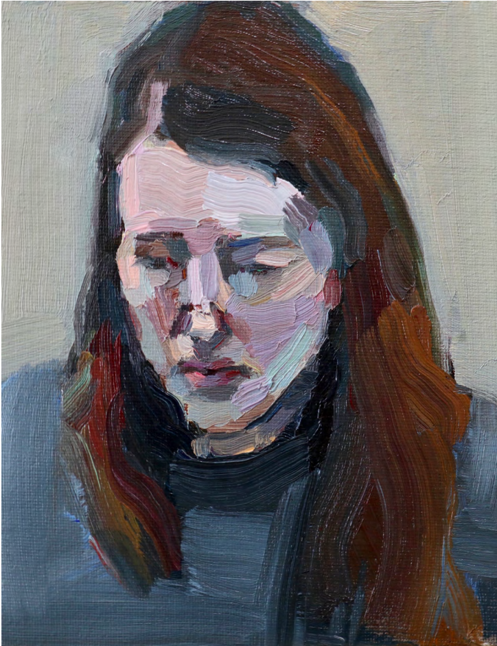
A Moment Of A Peace, 2023 Oil on canvas, framed in Tasmanian oak 19 x 15 cm