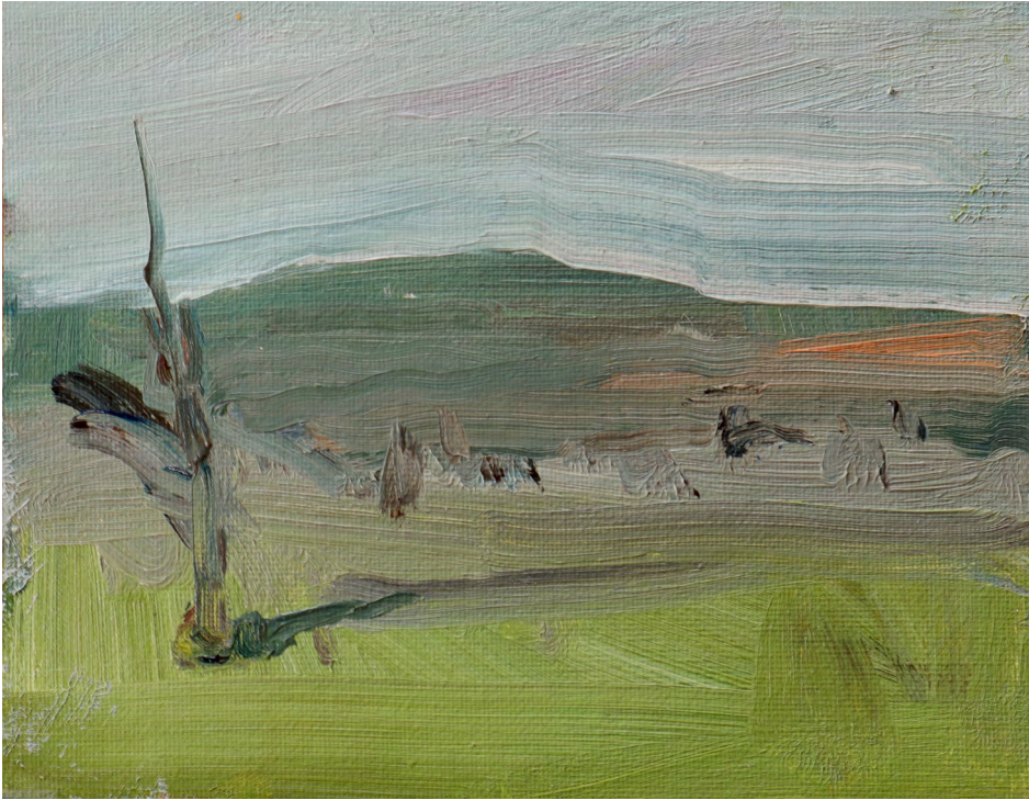
Reminds Me Of Home, 2023 Oil on canvas, framed in Tasmanian oak 15 x 19 cm