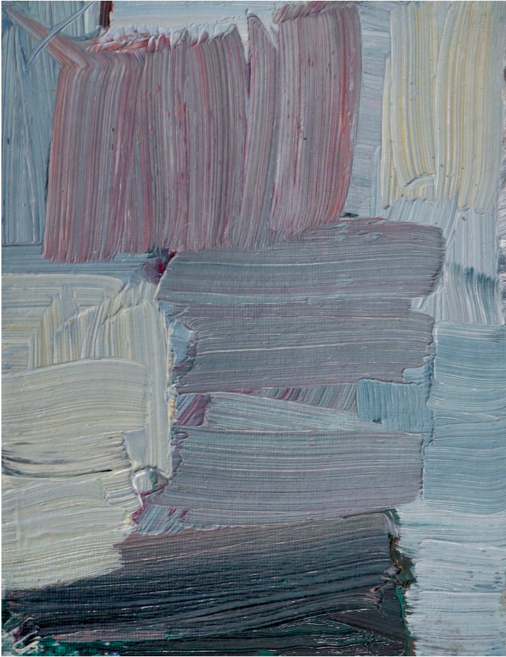
Connecting Flight , 2023 Oil on canvas, framed in Tasmanian oak 19 x 15 cm